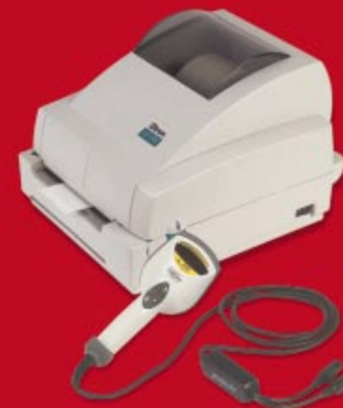
Bar Code Printer & Scanner