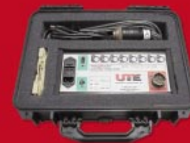
Single Node System

Relay Master™ Connecting into Customer's Needs.