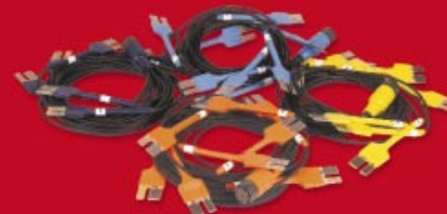
Octocon Cables With Paddles