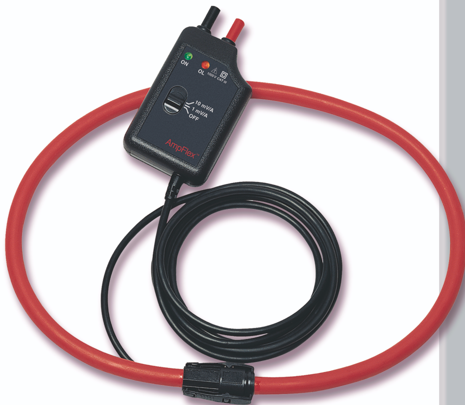
UTE P/N 16837-02

F or Railroad application, this Flexible Current Probe can be used for the measurement of Insulated Joint resistance. The flexible sensor permits measurements on conductors where standard clamp on probes cannot be used. The mV output is proportional to the current measured for direct readings on DMMs, loggers, oscilloscopes and power or harmonic meters. The length of the flexible sensor is 36". Other lengths are available upon request.